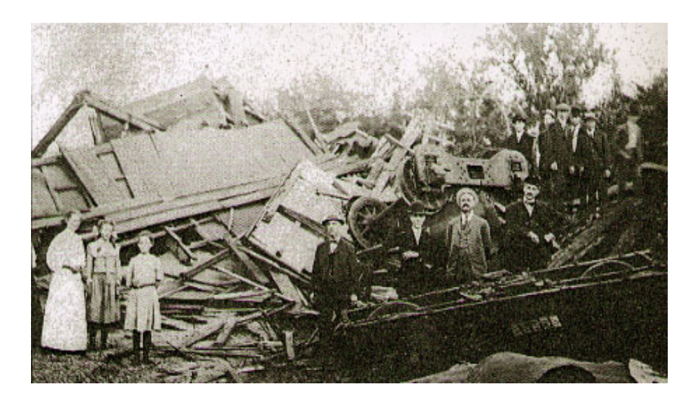
People began to arrive to view the wreck

As the news of the wreck spread people began to arrive, first hundreds and later thousands being present to view the wreck, and if possible obtain news of friends or some souvenir of the occasion. Many of these came from long distances, some with teams and many with automobiles.