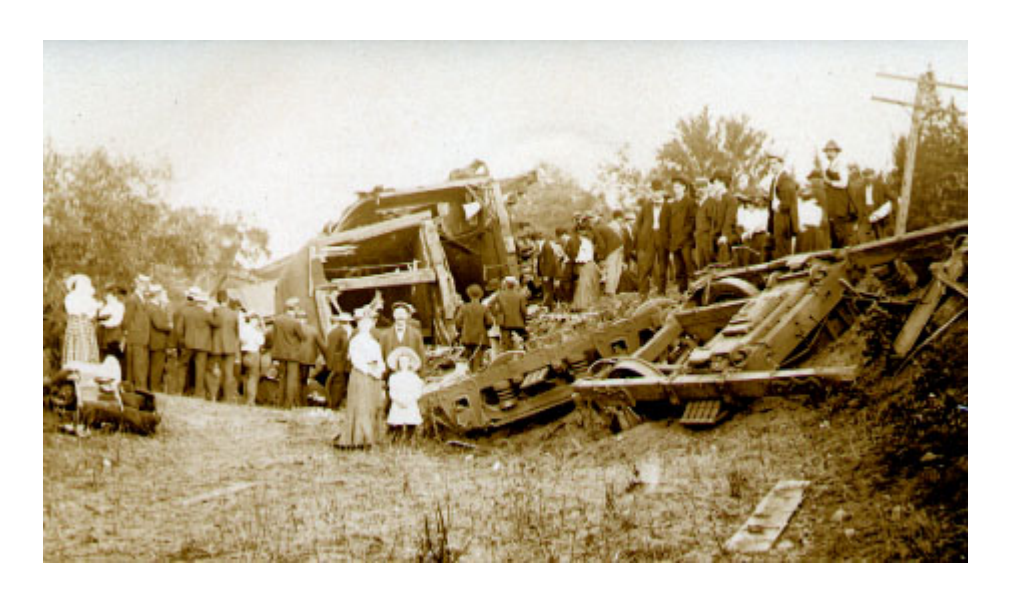
The baggage car was telescoped the whole length of the forward passenger car.

Both trains were running at a rapid speed, the freight making at the time more than 25 miles per hour, and the passenger twice that. The shock was something fearful, both engines being thrown to one side and entirely demolished. The forward cars of the freight crushed like paper boxes, and three or four cars near the middle of the train thrown across the track. On the express the baggage car was telescoped the whole length of the forward passenger car and both cars nearly demolished. The train was heavily loaded with people who were returning from the Sherbrooke fair and other Canadian points, mostly French Canadians, and when the baggage car plowed its way through the passenger coach it left a sickening scene of death and blood behind it. The flying timbers of the wrecked cars severed heads, arms and legs from the helpless victims, and a scene of horror was presented such as is seldom witnessed.