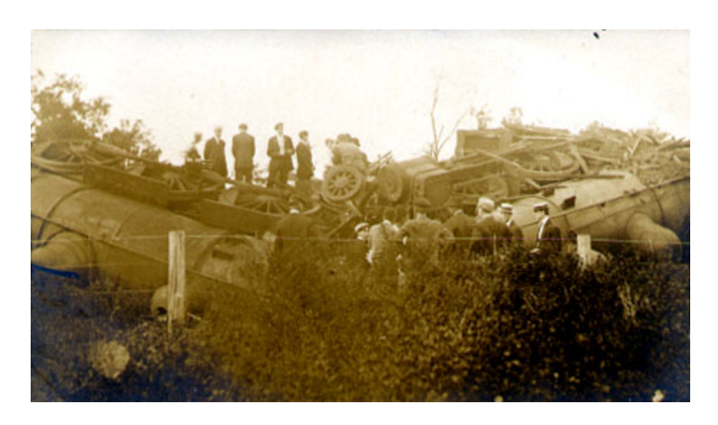
The shock was something fearful, both engines being thrown to one side.