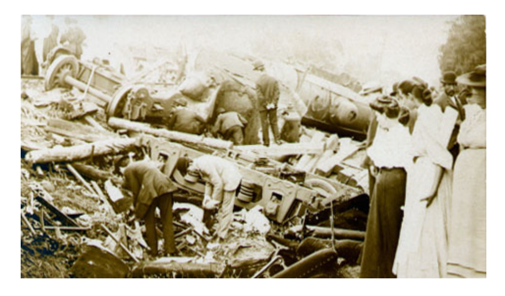
There was a constant stream going to and from the scene

All day there was a constant stream of carriages, automobiles and people on foot going to and from the scene of the disaster. Many came from Franklin, Bristol and Laconia, and some even farther.